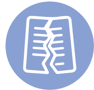
in the case of serious breaches, termination of employment, contract or engagement