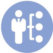
the restriction of duties