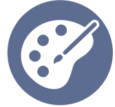
indirectly (such as in written assignments, in artworks or in any other way)