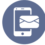
through electronic means (such as email)